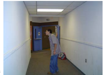
Here are the blank walls that used to be covered with art.