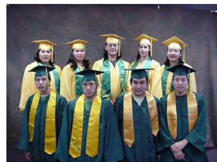
Your Senior Graduates