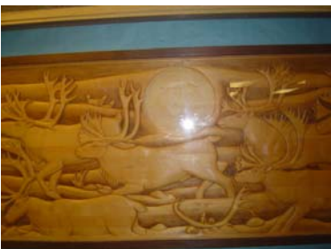
The piece that's missing.