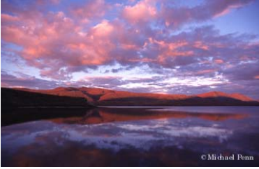
The Noatak River.