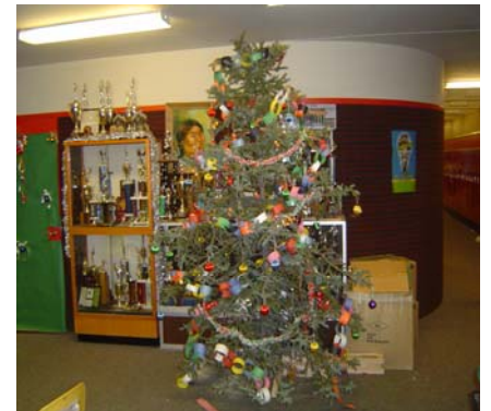
Getting into the holiday.

there were quite a few people, then slowly the crowd dissipated. The crowd left was a bunch of kids who were running around and playing. Overall, the bizarre was pretty good and we all had a little fun. I would definitely like to have another one.